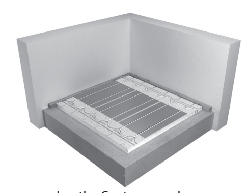
Lay the Contura panels