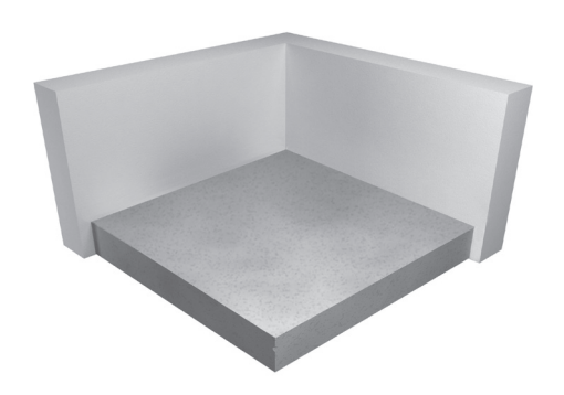
Prepare the subfloor

Where the pipe exits the floor or areas where the pipe may get damaged will required protection. Cover the pipe with the Warmup pipe conduit protection.