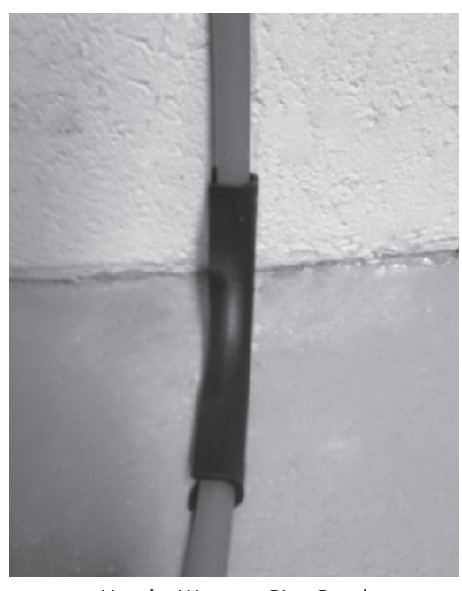
Use the Warmup Pipe Bend Support where it enters the floor.

When installing the conduit cut along the length of the conduit and clip onto pipe.