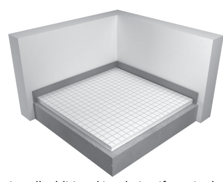
Install additional insulation if required